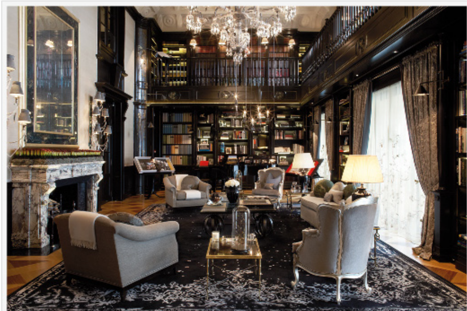
Living Room where you'd want to invite all your friends to tea.

The Art of Design' is available from http://www.candyandcandy.com priced at £75 + p&p.