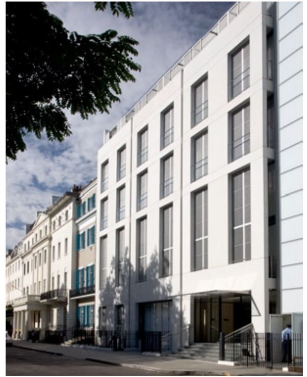
Front view of 21 Chesham Place