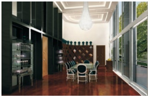
Formal front reception room (artist's impression)