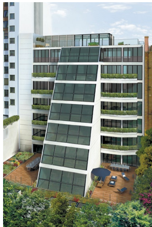
Rear view of 21 Chesham Place (artist's impression)