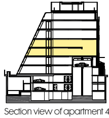
Section view of apartment 4

Since its complete in 2008, 21 Chesham Place has won a reputation as the most sort after residential address in Belgravia.