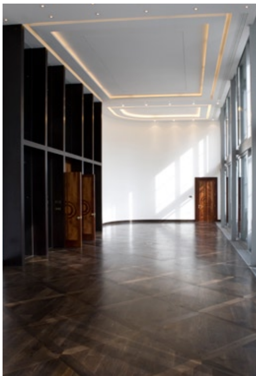
Formal front reception room